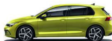
Lime Yellow Metallic*