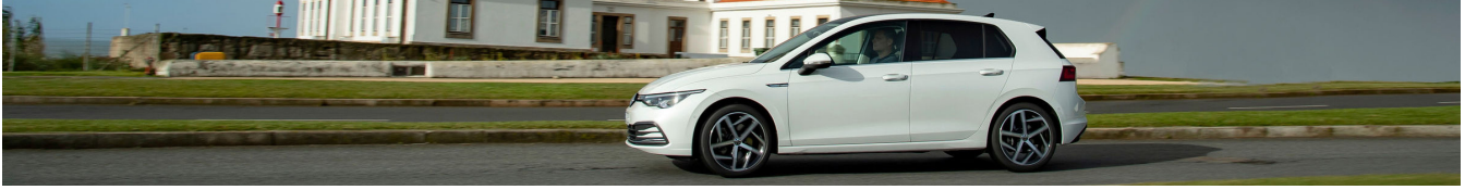
Note: Image displays optional 18" Dallas alloy wheels