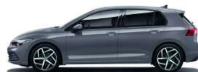
Moonstone Grey Solid*