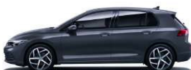
Dolphin Grey Metallic*