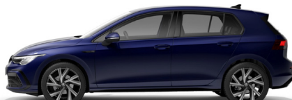
Lapiz Blue Metallic* 1