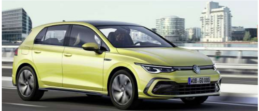
Note: The above image displays optional Panoramic Sunroof, Matrix lights and 18" Bergamo alloy wheels