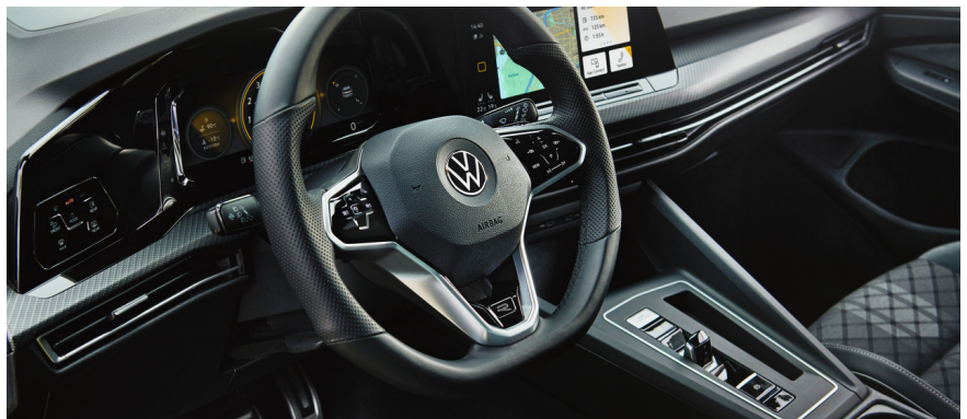
Note: The above image displays DSG Gear Selector