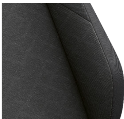
'Maze' cloth Soul (BD) Standard on Life models