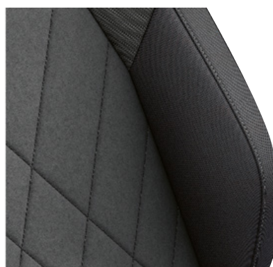
'ArtVelours' cloth Soul (BD) Standard on Style models