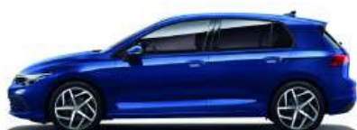
Atlantic Blue Metallic*