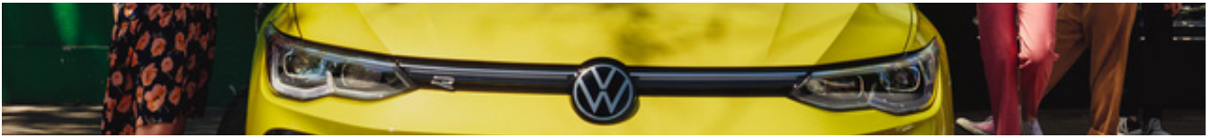
Note: The above image displays optional Matrix lights