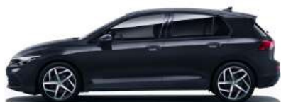
Urano Grey Solid