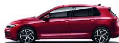
Kings Red Metallic*