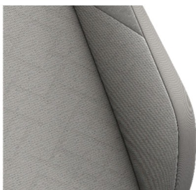
'Maze' cloth Storm Grey (CE) Standard on Life models