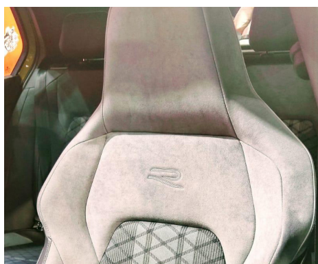
'R-Line' cloth Anthracite (IR) Standard on R-Line

* Optional at extra cost. Please note, the print processes do not allow exact reproduction of the upholstery colours.