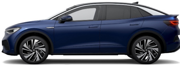
Blue Dusk Metallic 1,2 2PA1