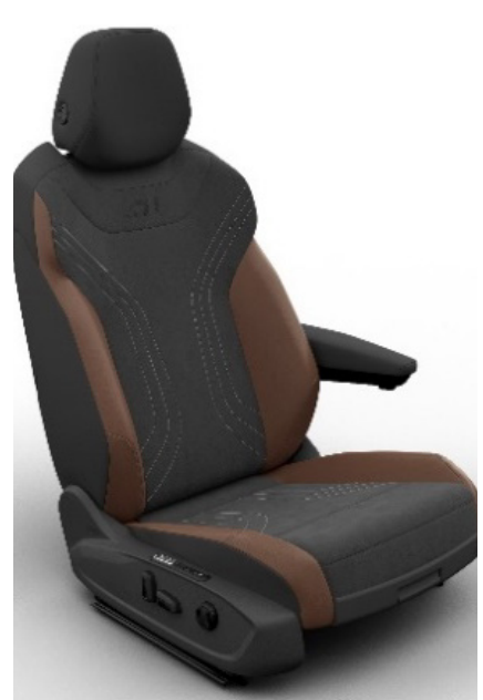
Artvelours Microfleece/Leatherette Soul/Florence Brown Standard from ID.5 PURE PLUS / PRO PLUS Optional on ID.5 PURE / PRO Electric controls are available via the addition of the Interior Plus Package