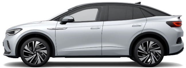
Scale Silver Metallic 1,3 1TA1