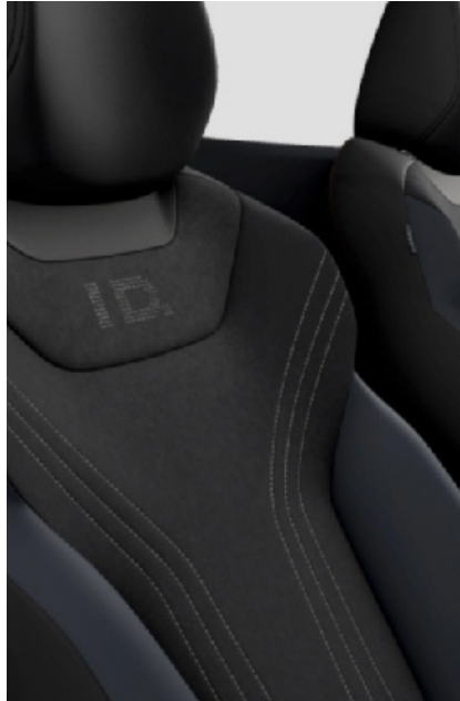
Artvelours Microfleece/Leatherette Soul/Platinum Grey Standard from ID.5 PURE PLUS / PRO PLUS Optional on ID.5 PURE / PRO Electric controls are available via the addition of the Interior Plus Package