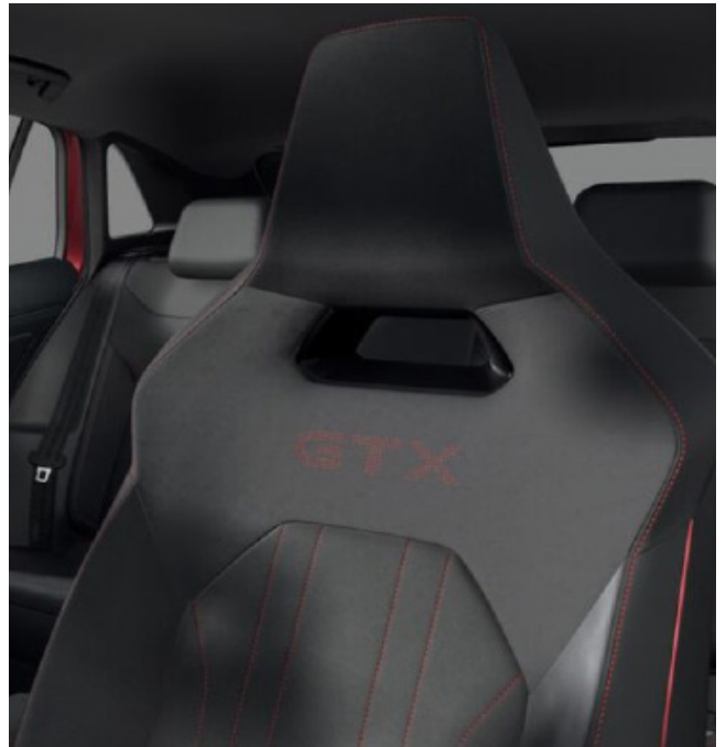
GTX Art Velours/Leatherette Soul/Flash Red Standard on ID.5 GTX PLUS Optional on ID.5 GTX

Note: Some parts of leather interior trim will contain artificial leather. Note: The print processes do not allow exact reproduction of the upholstery & insert colours.