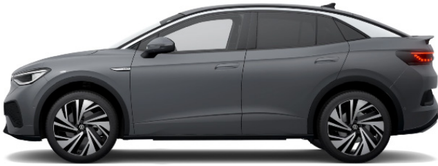
Moonstone Grey Solid C2A1