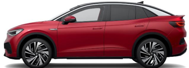
King's Red Metallic 1 P8A1