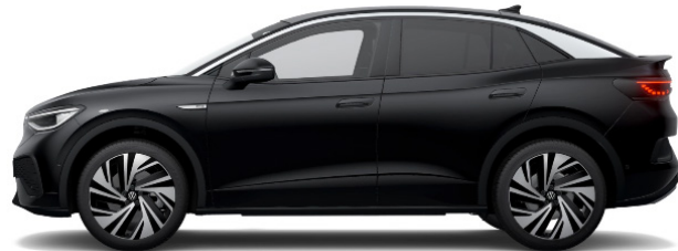
Mythos Black Metallic 1 OE0E