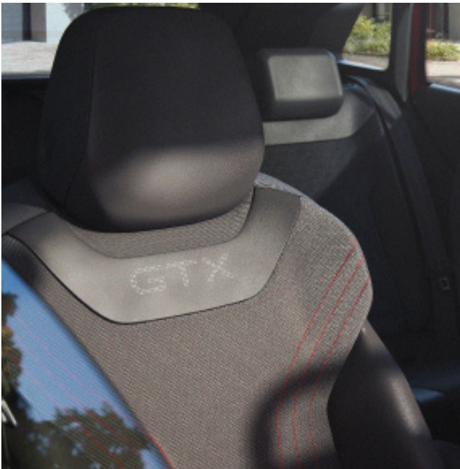
GTX Cloth/Leatherette Soul/Flash Red Standard on ID.5 GTX