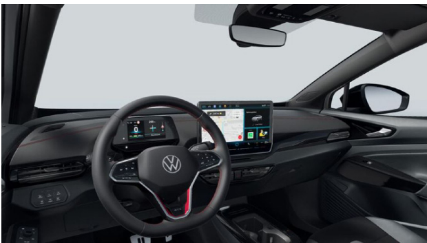
Standard on ID.5 GTX / GTX PLUS