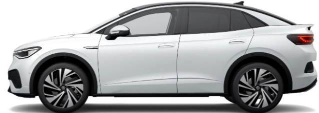
Glacier White Metallic 1 2YA1